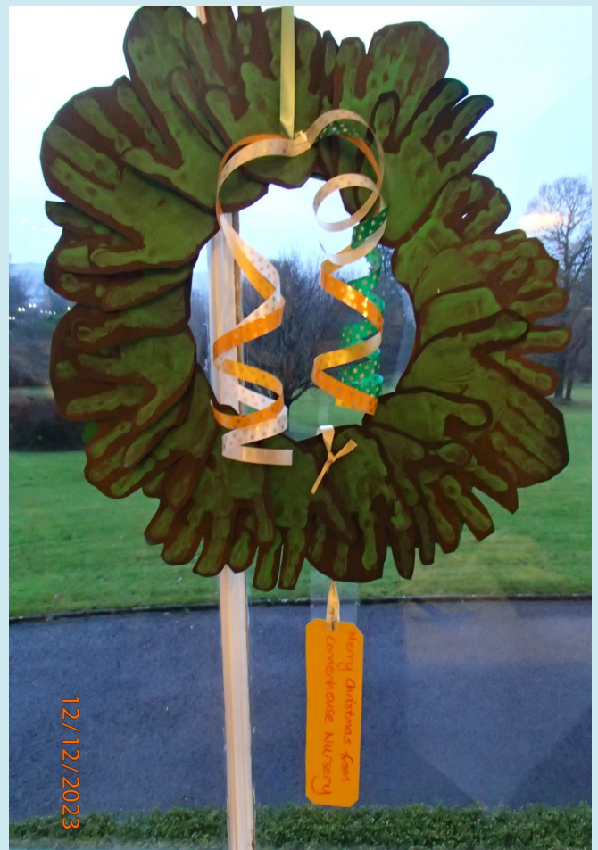
Christmas felt wreath made of "residents' hands"