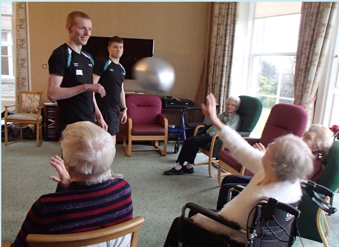
Balloon Volleyball with Perth College Students