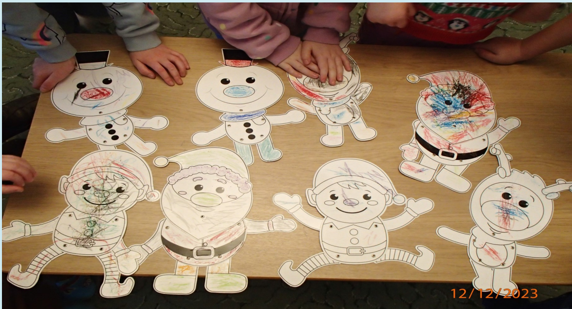
Christmas decorations by Corner House Nursery children