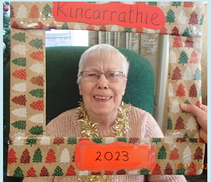
Some Christmas party guests ....