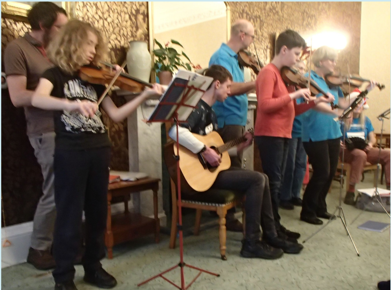
The Blackford Fiddlers