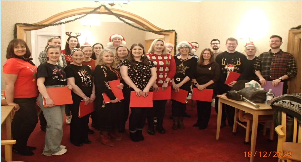
Perth Amateur Operatic Society visiting in December to sing carols (plus mulled wine and mince pies!)