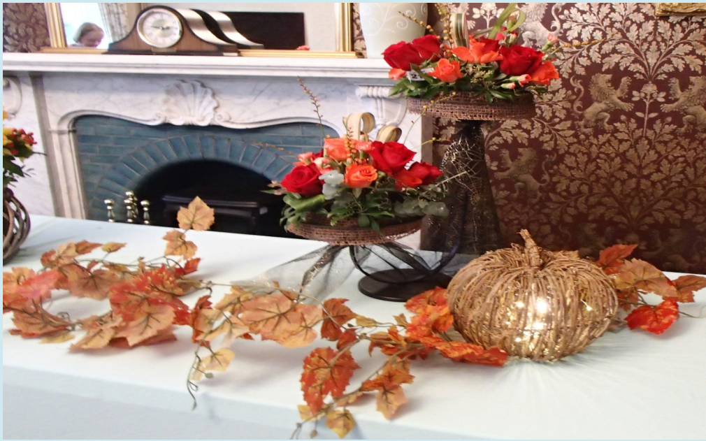
Autumn flower arrangement by Lynn Bryce