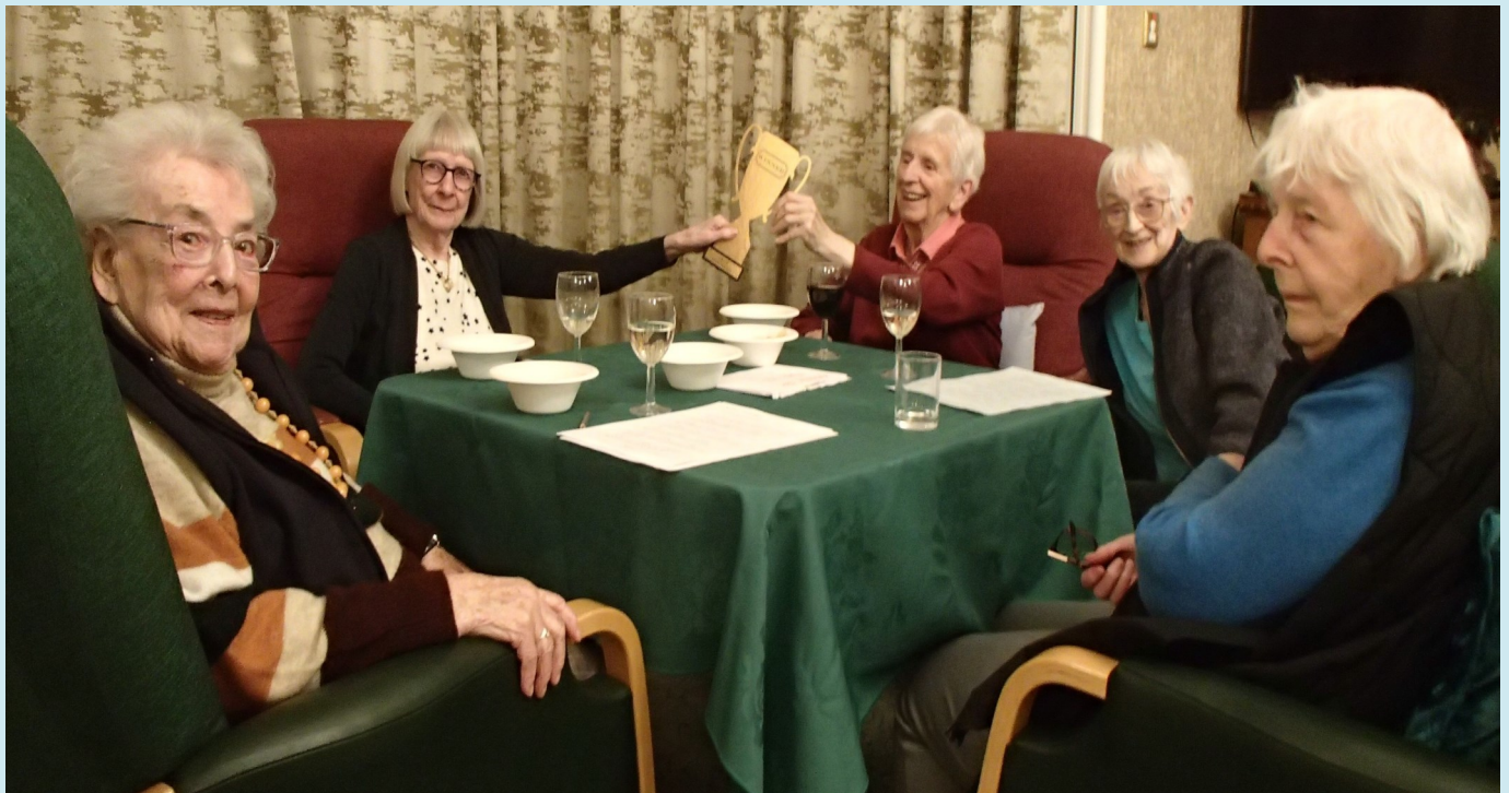
Quiz Night winning team in January