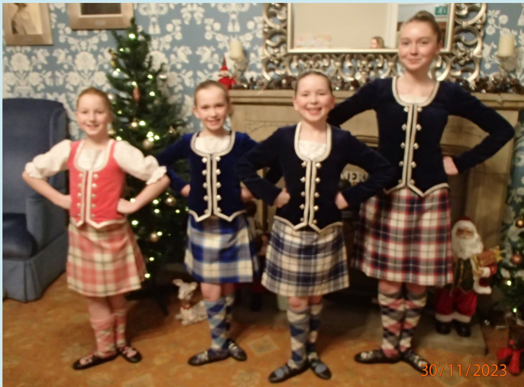
Visiting Highland Dancers for Burns Day Celebration